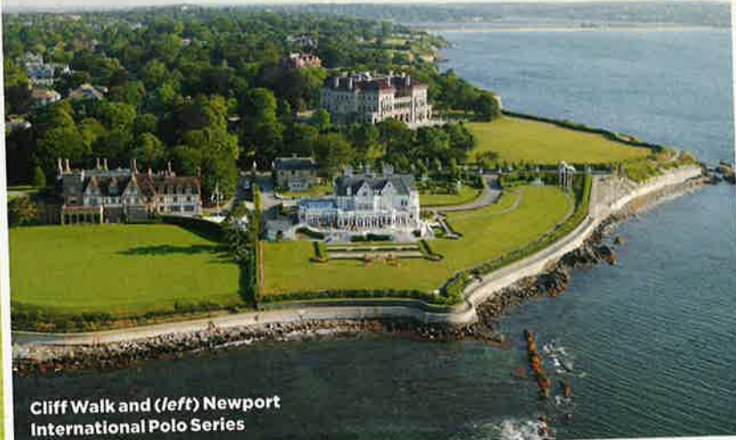
Cliff Walk and (left) Newport International Polo Series